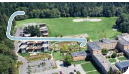
The blue line indicates the path of the new ethnobotanical trail

The project, based at the Missouri Botanical Garden, is operated under the umbrella of United Plant Savers, a nonprofit network of plant sanctuaries seeking to preserve biodiversity and plant knowledge for the future.