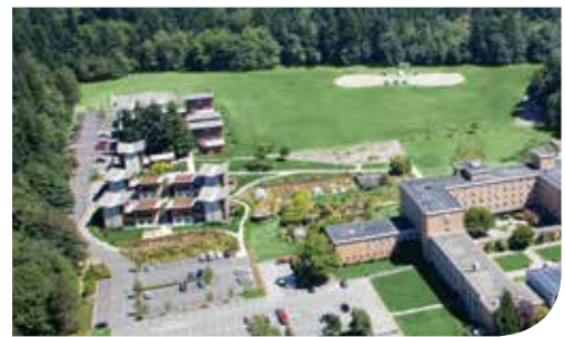
Rotary Grant Boosts Sacred Seeds Project