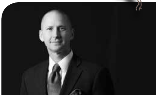
Bastyr Welcomes New President