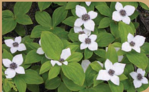
Bunchberry ( Cornus canadensis )